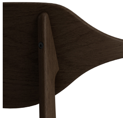
DARK SMOKED OAK BARNUM BOUCLE COL 3