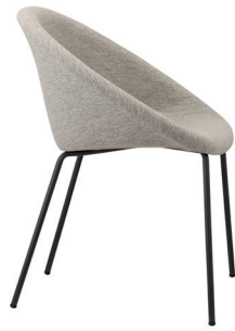
2685 VA T6 28

Poltrona con scocca imbottita e anima in tecnopolimero. Struttura a 4 gambe in acciaio tubolare \varnothing mm 16 verniciato antracite. Giulia Pop è adatta a tutti gli ambienti dalla casa al contract. Rivestimento in tessuto non sfoderabile. Per uso interno.