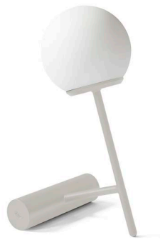
Light Grey 1755139