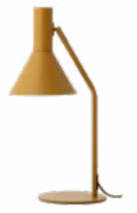
Matt almond: art.no. 101397