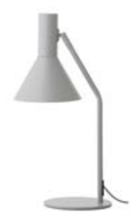
Matt light grey: art.no. 101399