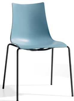
2615 VA 62