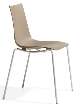
2615 VL 15