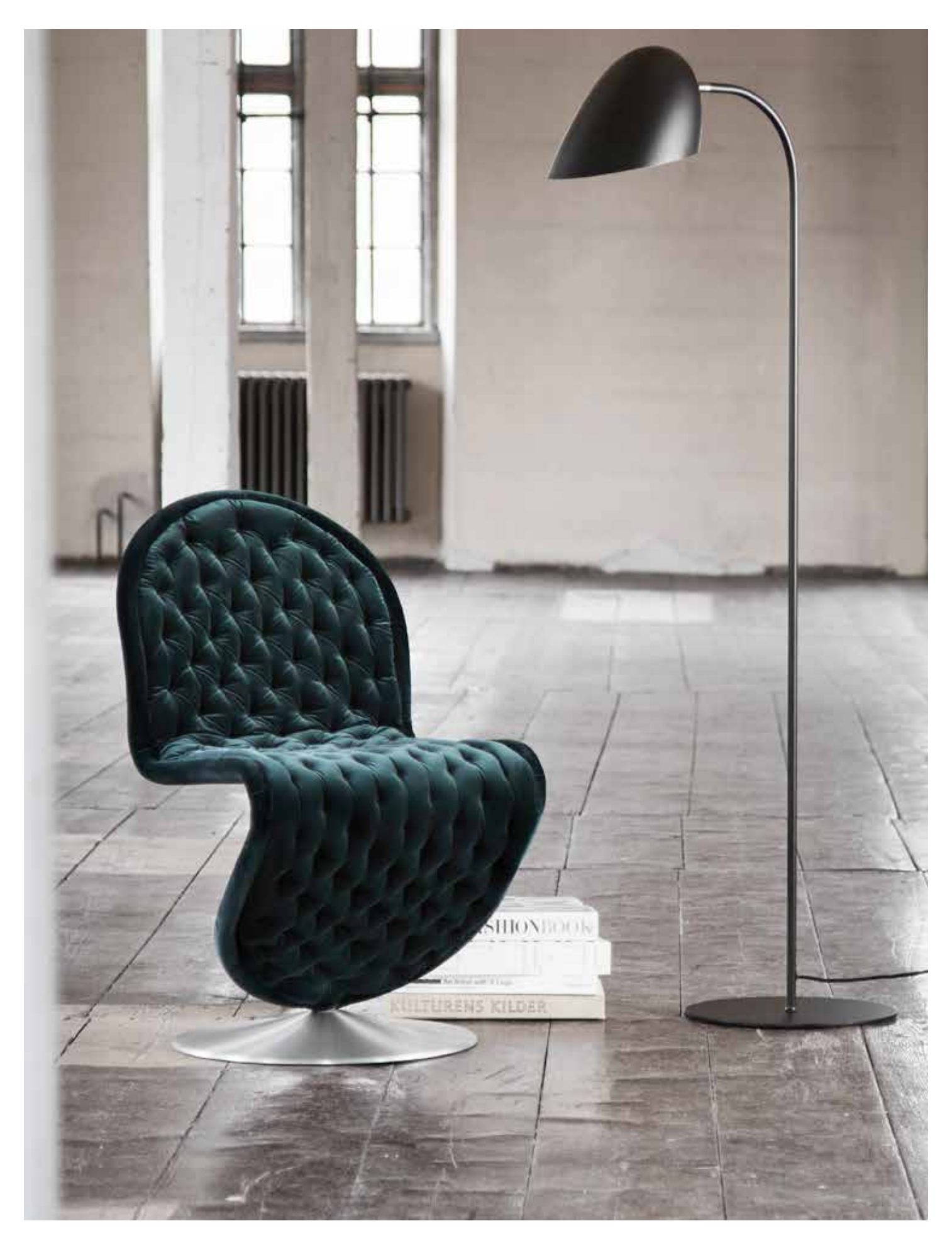
HITCHCOCK FLOOR LAMP IN MATT BLACK METAL. HEIGHT 150 CM.