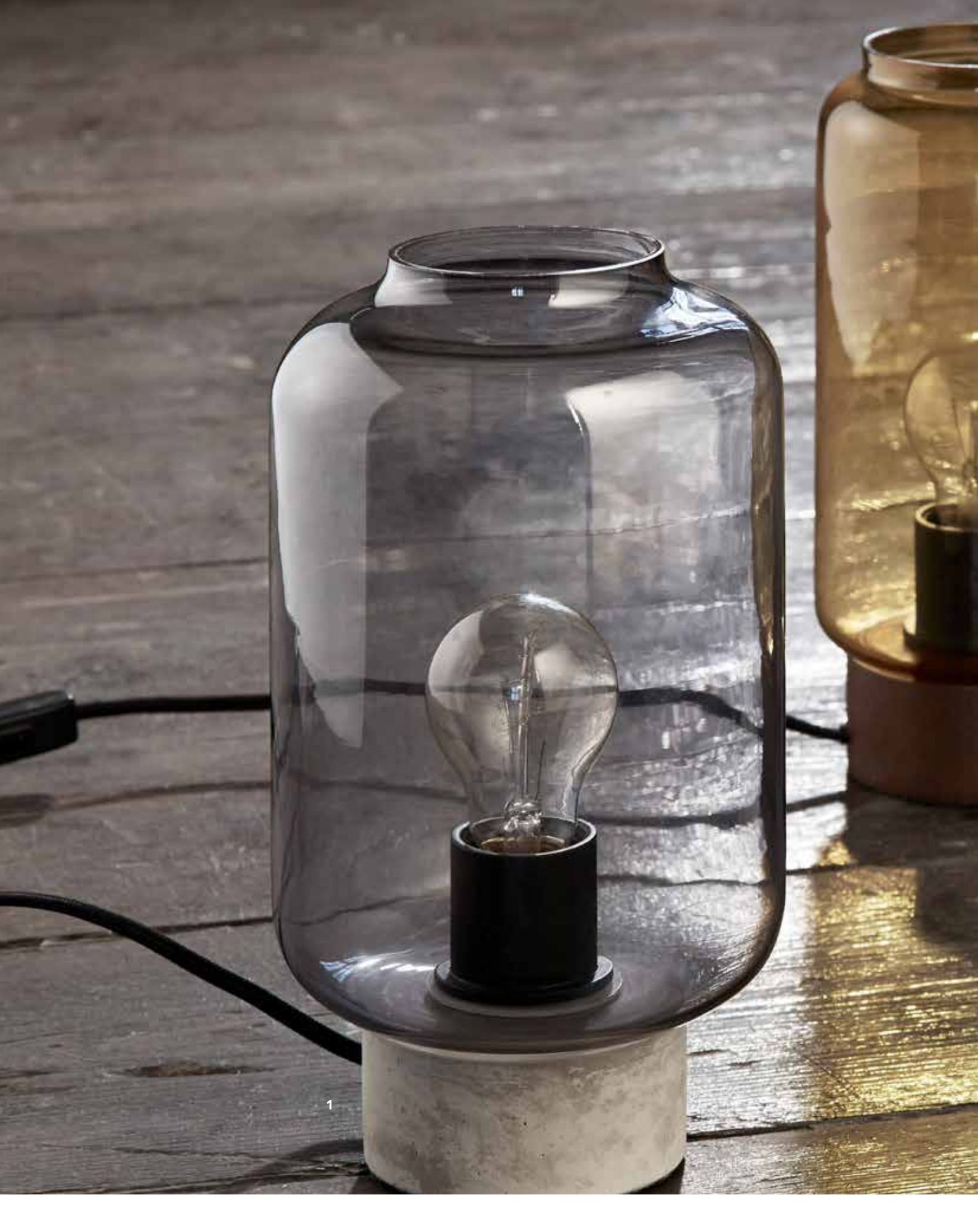
1: COLUMN TABLE LAMP Ø16 CM. HEIGHT 27 CM. CONCRETE BASE WITH SMOKE GLASS 2: COLUMN TABLE LAMP Ø16 CM. HEIGHT 27 CM. WOOD BASE WITH AMBER GLASS 3: COLUMN TABLE LAMP Ø16 CM. HEIGHT 22 CM. WHITE MARBLE BASE WITH CLEAR GLASS.