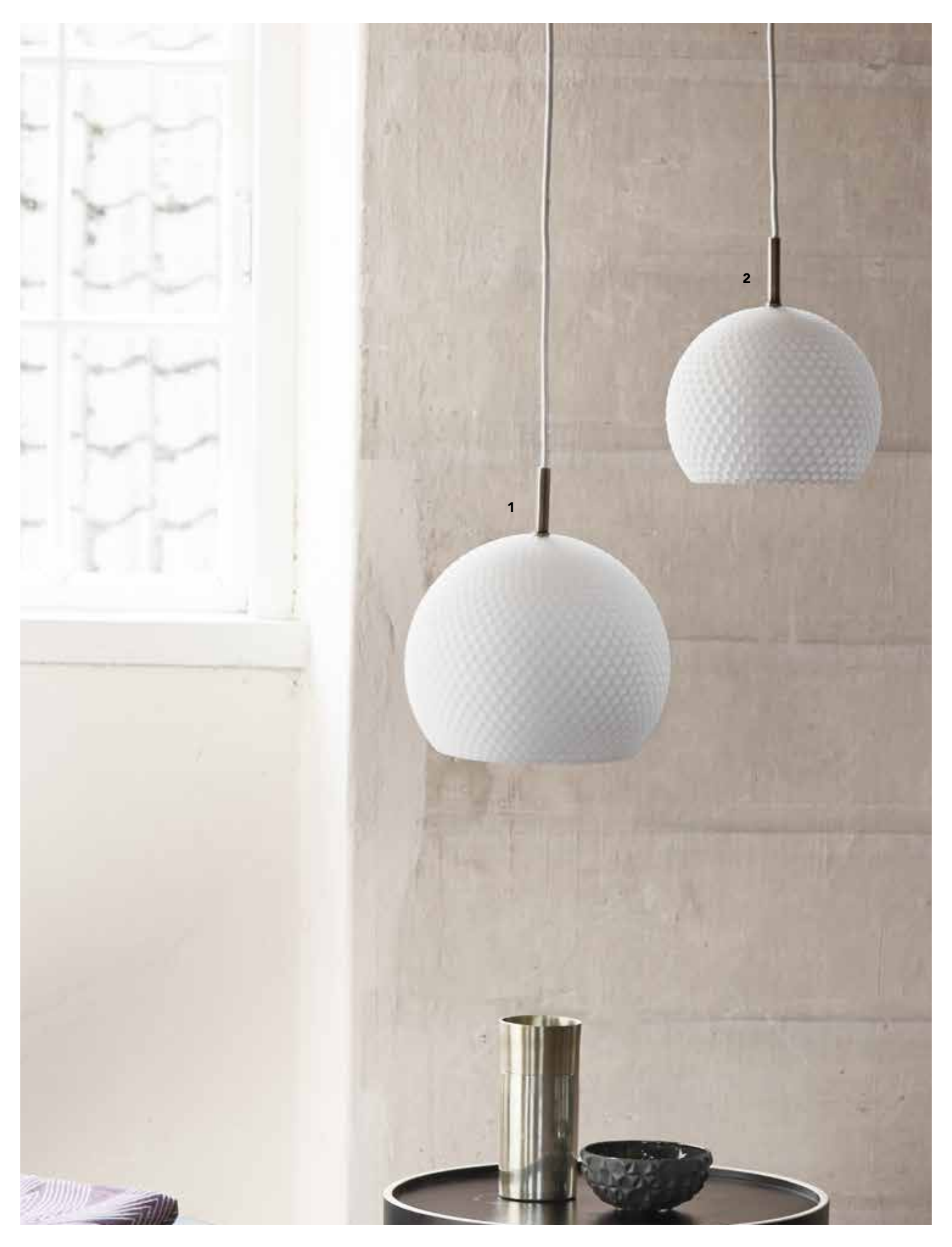
f 1: COMB PENDANT Ø25 CM IN WHITE GLASS f 2: COMB PENDANT Ø20 CM IN WHITE GLASS.