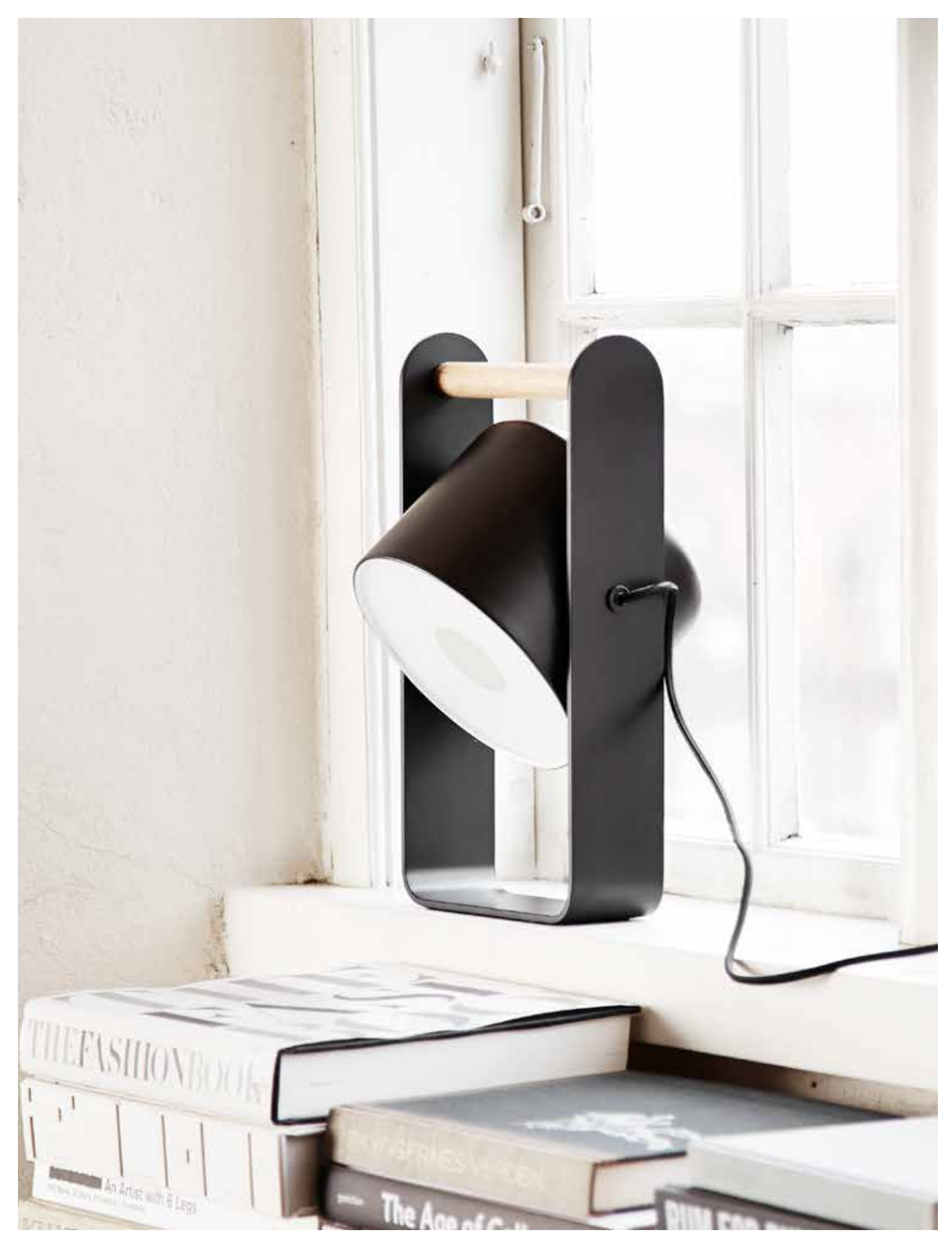
SPHERE TABLE LAMP IN MATT BLACK METAL WITH OAK HANDLE. ALSO AVAILABLE IN WHITE. HEIGHT 36 CM.