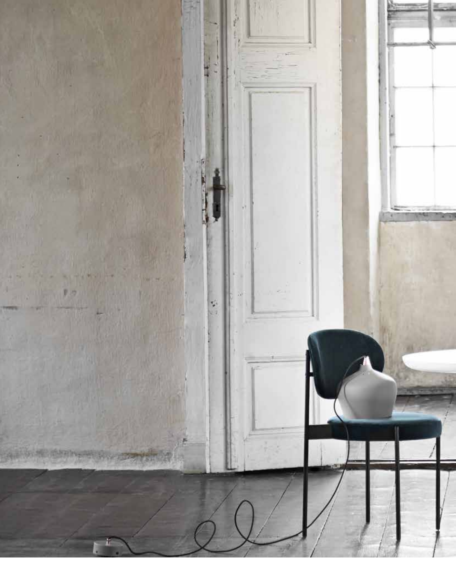
COHEN METAL PENDANTS. AVAILABLE IN 3 SIZES: \emptyset 16, \emptyset 25 AND \emptyset 32 CM IN THE COLOURS GREY, NUDE, WHITE, PETROL BLUE, COPPER, BRASS AND BLACK.