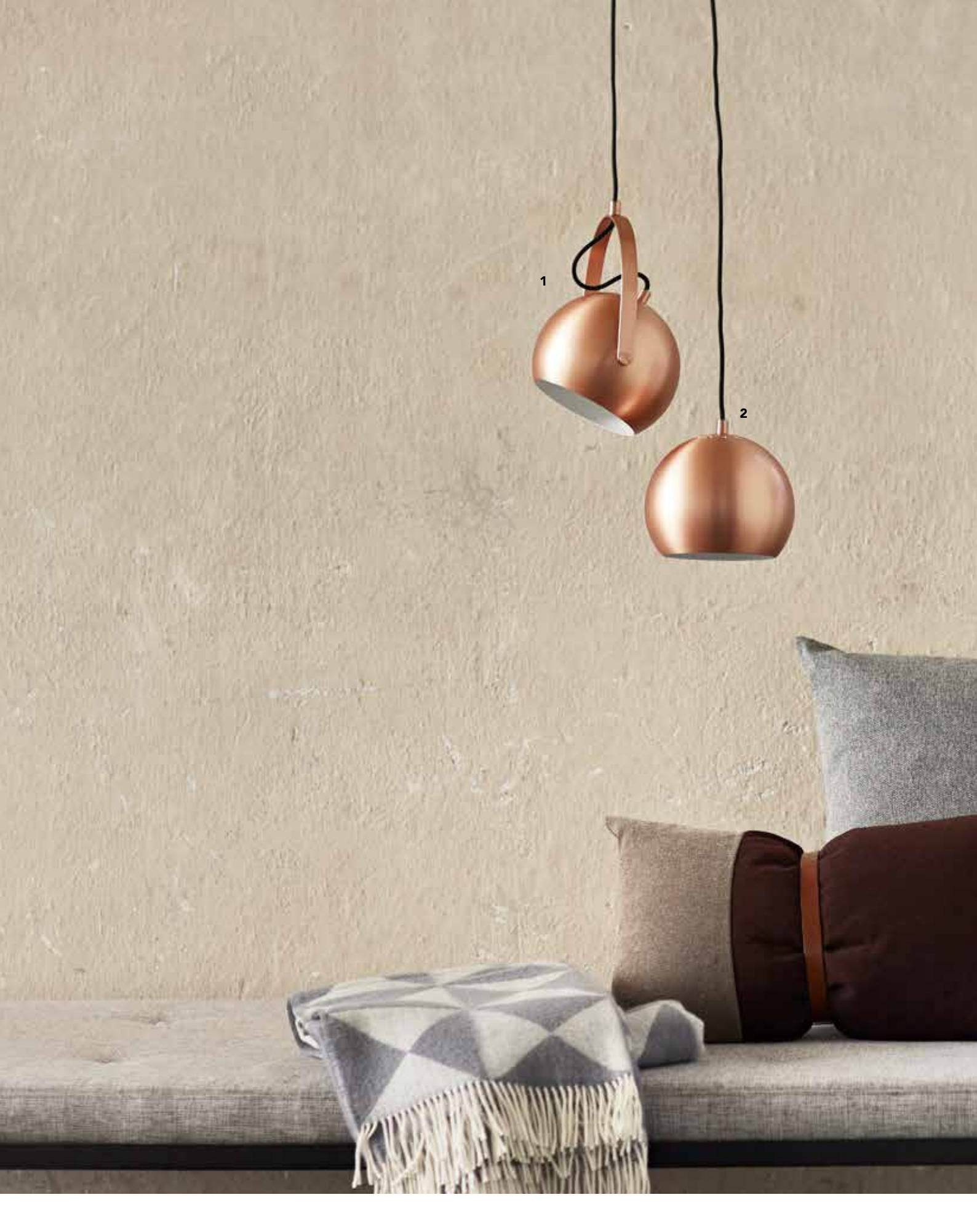
1: BALL WITH HANDLE PENDANT IN BRUSHED COPPER. Ø18 CM 2: BALL PENDANT Ø18 CM IN BRUSHED COPPER. 3: BALL PENDANT Ø18 CM IN ANTIQUE BRASS.