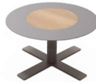
BLUSH 70 RND