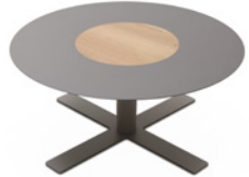
BLUSH 90 RND