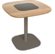
BLUSH 80 SQ WOOD