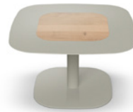
BLUSH 70 SQ