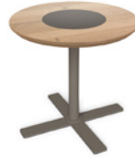
BLUSH 80 RND WOOD