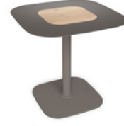
BLUSH 80 SQ