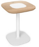
BLUSH 60 SQ WOOD