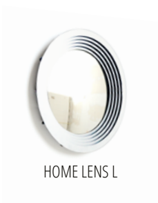
HOME LENS L