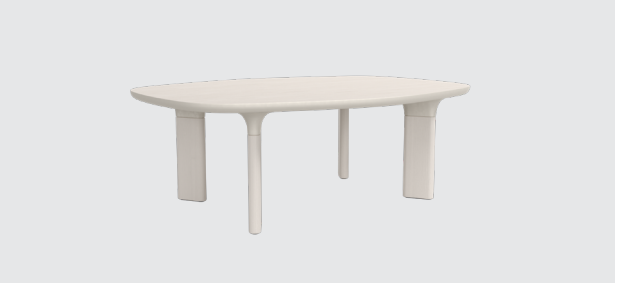
TABLETOP: COLOURED VENEER, ASH - LIGHT BEIGE (135) BASE: COLOURED SOLID WOOD, ASH - LIGHT BEIGE (135) TRUMPET: POWDER COATED ALUMINIUM, LIGHT BEIGE

TABLETOP: CLEAR LACQUERED VENEER, WALNUT TABLETOP (UNDERSIDE): BLACK BASE: CLEAR LACQUERED SOLID WOOD, WALNUT TRUMPET: POWDER COATED ALUMINIUM, BLACK