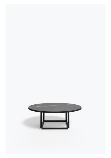
Gris du Marais Marble w. Black Frame