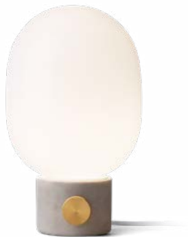
Light Grey/Brass 1800129