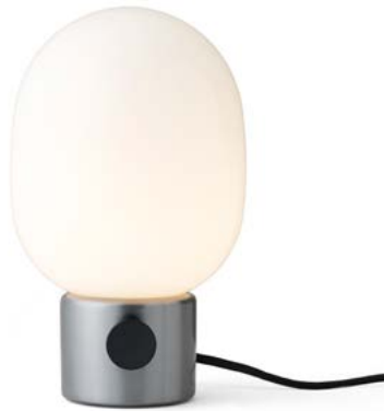
Brushed Steel 1800039