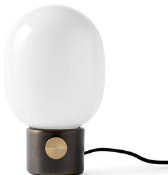
Bronzed Brass 1800859