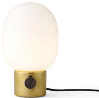
Mirror Polished Brass 1800839