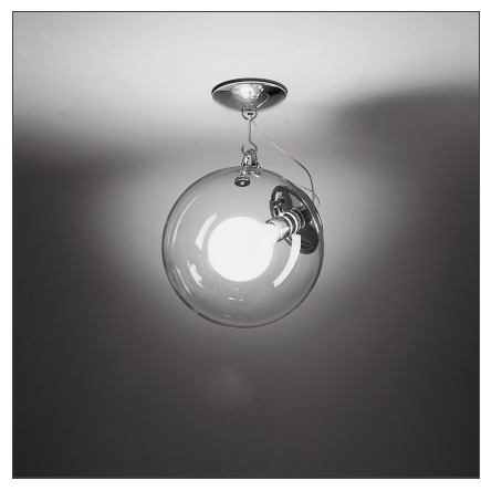
IP20 ⊕ ∰ ♥ № © Dimmerable: + •