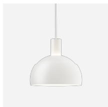
FJ Elements Pendant