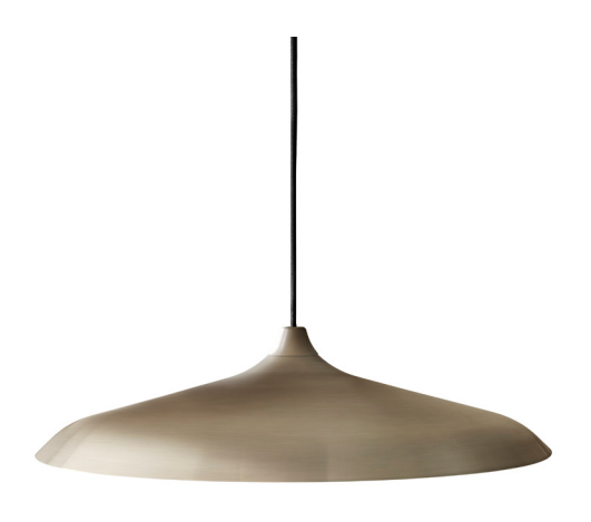
Bronzed Brass 1680869