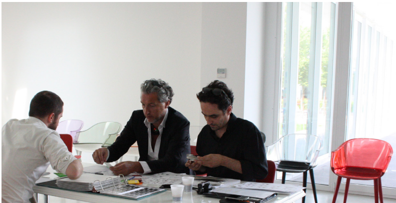
Designer in Magis

of Cyborg, a seat with a highly resistant and versatile polycarbonate shell. The seat can then be completed with backrests in a selection of different natural or synthetic materials: from polycarbonate to wicker, from solid wood to plywood, to the most recent upholstered versions with fabric or leather cover. This further evolution of the chair is in equal parts poetic and technological, cosy and surprising, in keeping with the widest range of different settings.