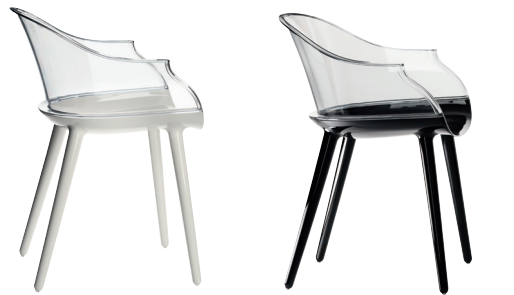
Frame: Glossy White 1736 C Transparent Clear 2540 TR