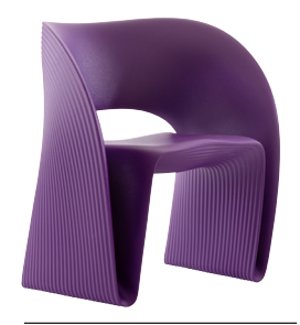
Matt colour Purple 1156 C