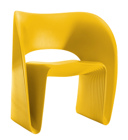
Matt colour Yellow 1665 C