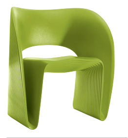
Matt colour Lime Green 1346 C