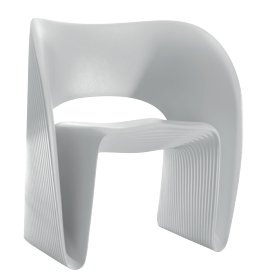
Matt colour White 1735 C