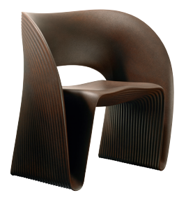
Matt colour Rust Brown 1069 C