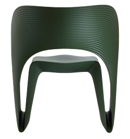
Matt colour Olive Green 1517 C