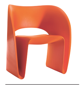
Matt colour Orange 1001 C