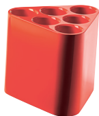
Glossy colours Orange 1088 C