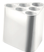
Glossy colours White 1673 C