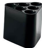
Glossy colours Black 1764 C