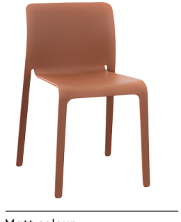
<u>Matt colour</u> Terracotta 1480 C