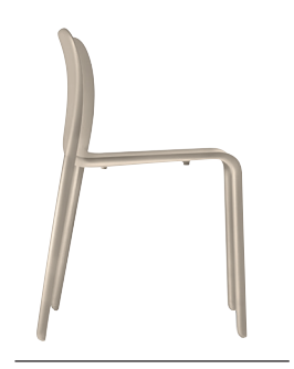
Matt colour Beige 1450 C