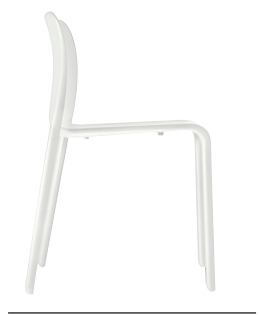
Matt colour White 1735 C