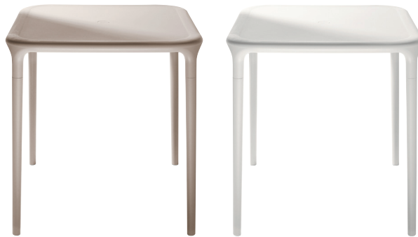
Matt colour Beige 1450 C