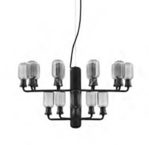
Amp chandelier small H: 32,5 x Ø: 62,5 cm