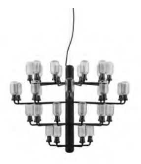
Amp chandelier large H: 62,5 x Ø: 85 cm