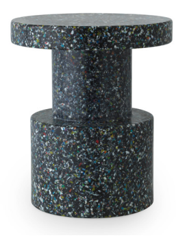
Bit stool Black Multi H: 42 x Ø: 36 cm