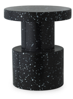
Bit stool Black H: 42 x Ø: 36 cm