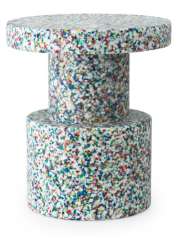
Bit stool White Multi H: 42 x Ø: 36 cm