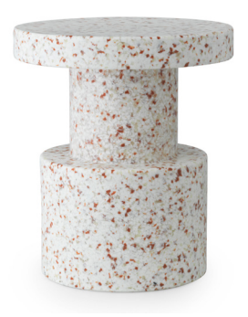
Bit stool White H: 42 x Ø: 36 cm