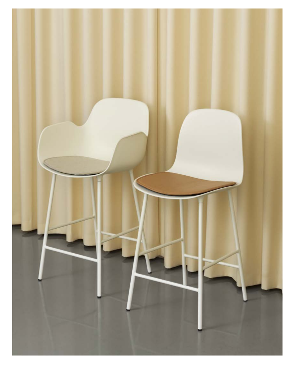
Form bar armchair 65 cm steel with seat cushion, Form bar chair 65 cm steel with seat cushion