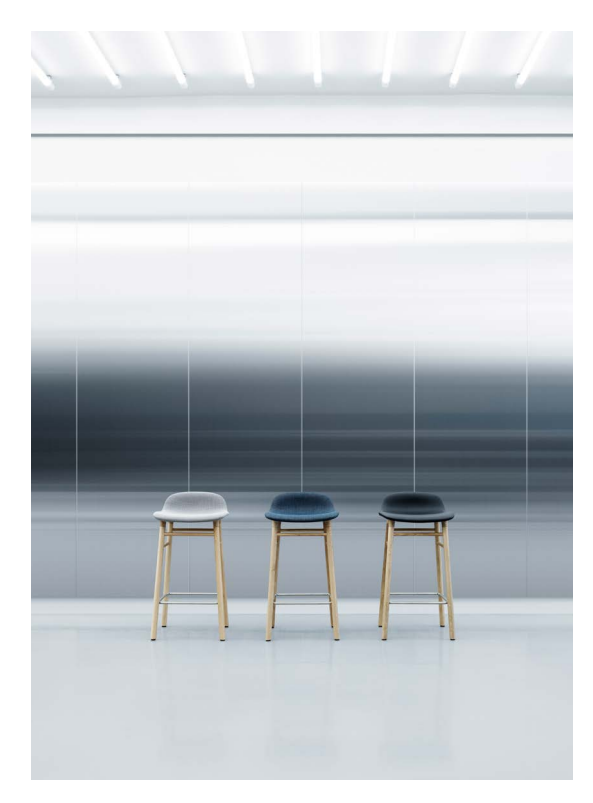
Form bar stool 65 cm full upholstery oak