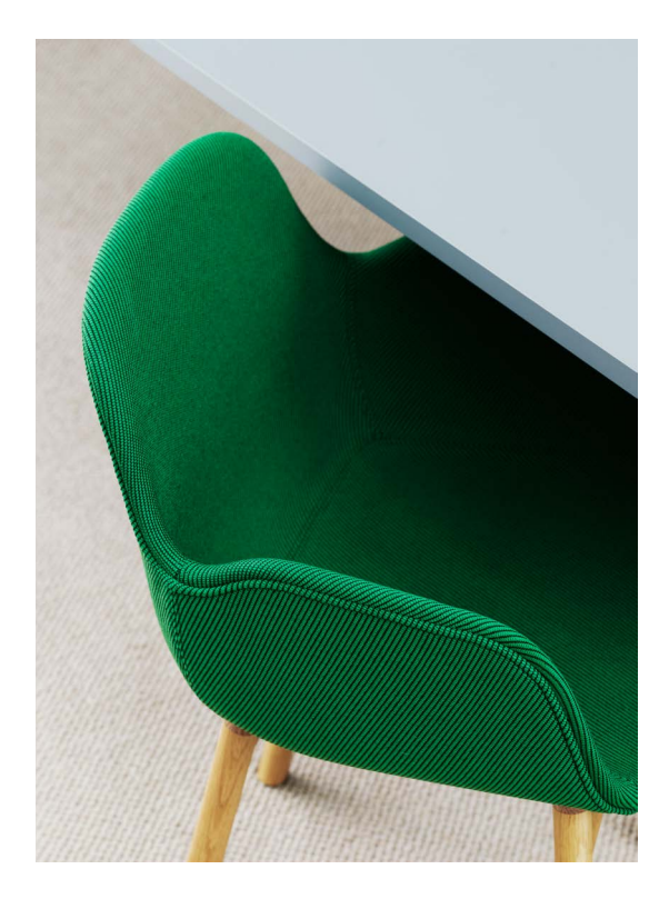
Form armchair full upholstery oak