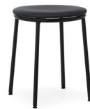
Circa stool 45 cm Ultra leather black