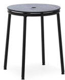
Circa stool 45 cm Black oak