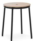
Circa stool 45 cm Oak