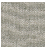
Camira Main line flax 20 Sand