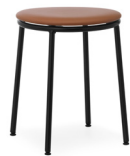
Circa stool 45 cm Ultra leather brandy