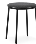
Circa stool 45 cm MLF16 black