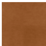
Sørensen leather Ultra brandy