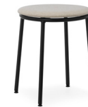
Circa stool 45 cm MLF20 sand