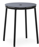
Circa stool 45 cm Black aluminum