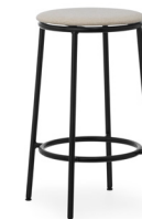
Circa stool 65 cm MLF20 sand