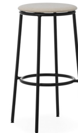
Circa stool 75 cm MLF20 sand