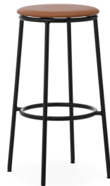
Circa stool 75 cm Ultra leather brandy