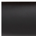
Black powder coated steel