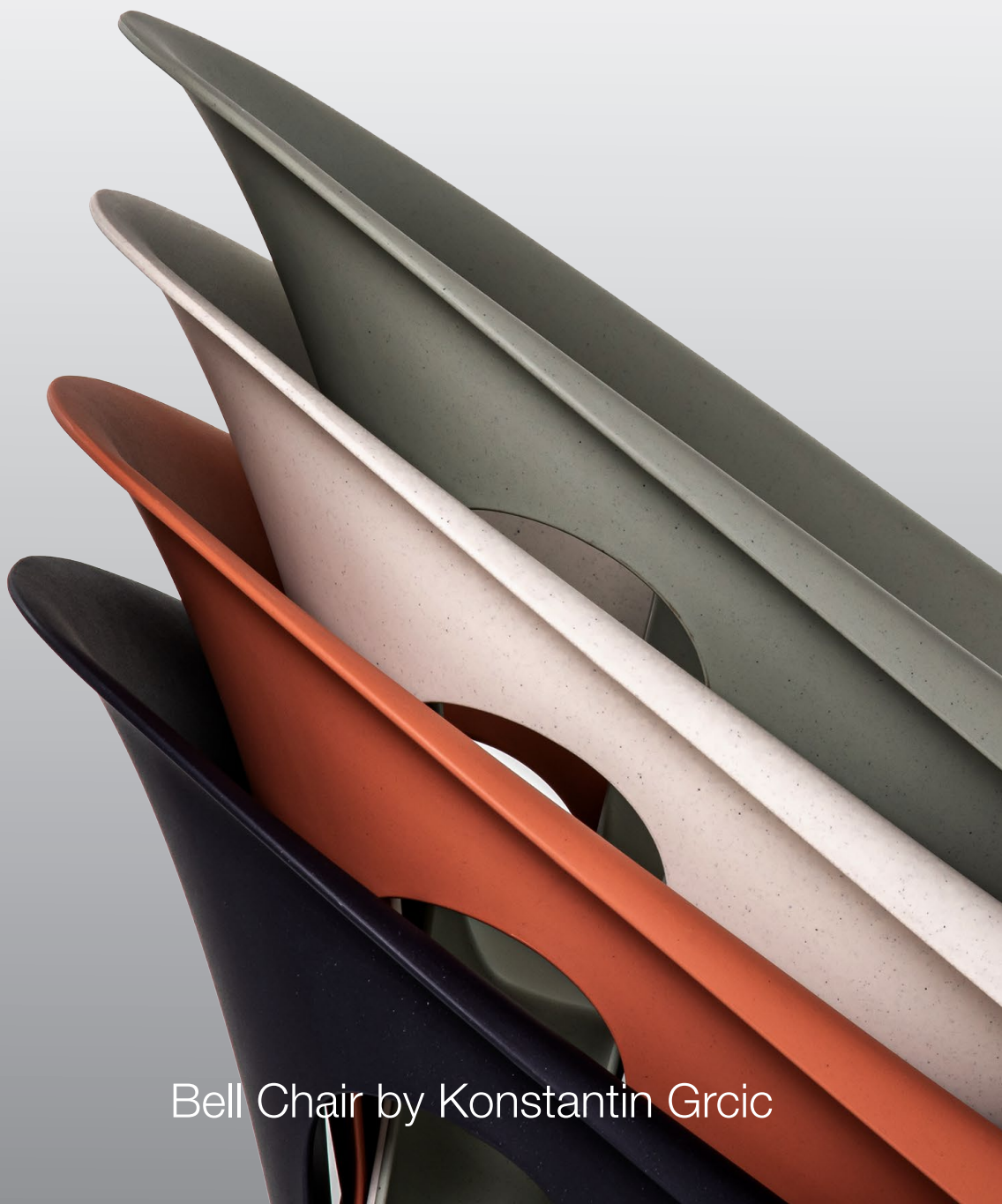
Bell Chair by Konstantin Grcic