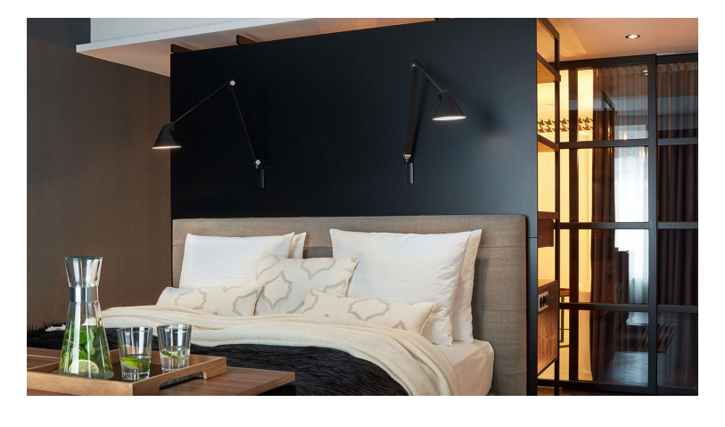
Wohnidee suits in Radisson Blu Hotel