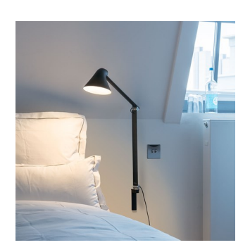
Set location - The Qvest

In 2002 Oki Sato founded nendo design studio. nendo means 'clay' in Japanese – or more specifically, modelling clay such as plasticine. A unique material that makes it easy to do creative modelling.