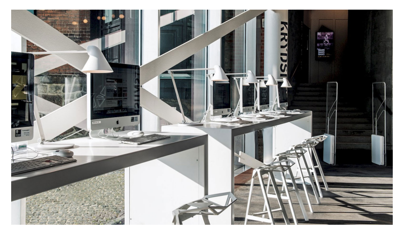
NJP - Biblioteket Kulturværftet