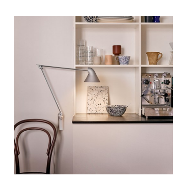
Set location -Kanslergade

In 2002 Oki Sato founded nendo design studio. nendo means 'clay' in Japanese – or more specifically, modelling clay such as plasticine. A unique material that makes it easy to do creative modelling.