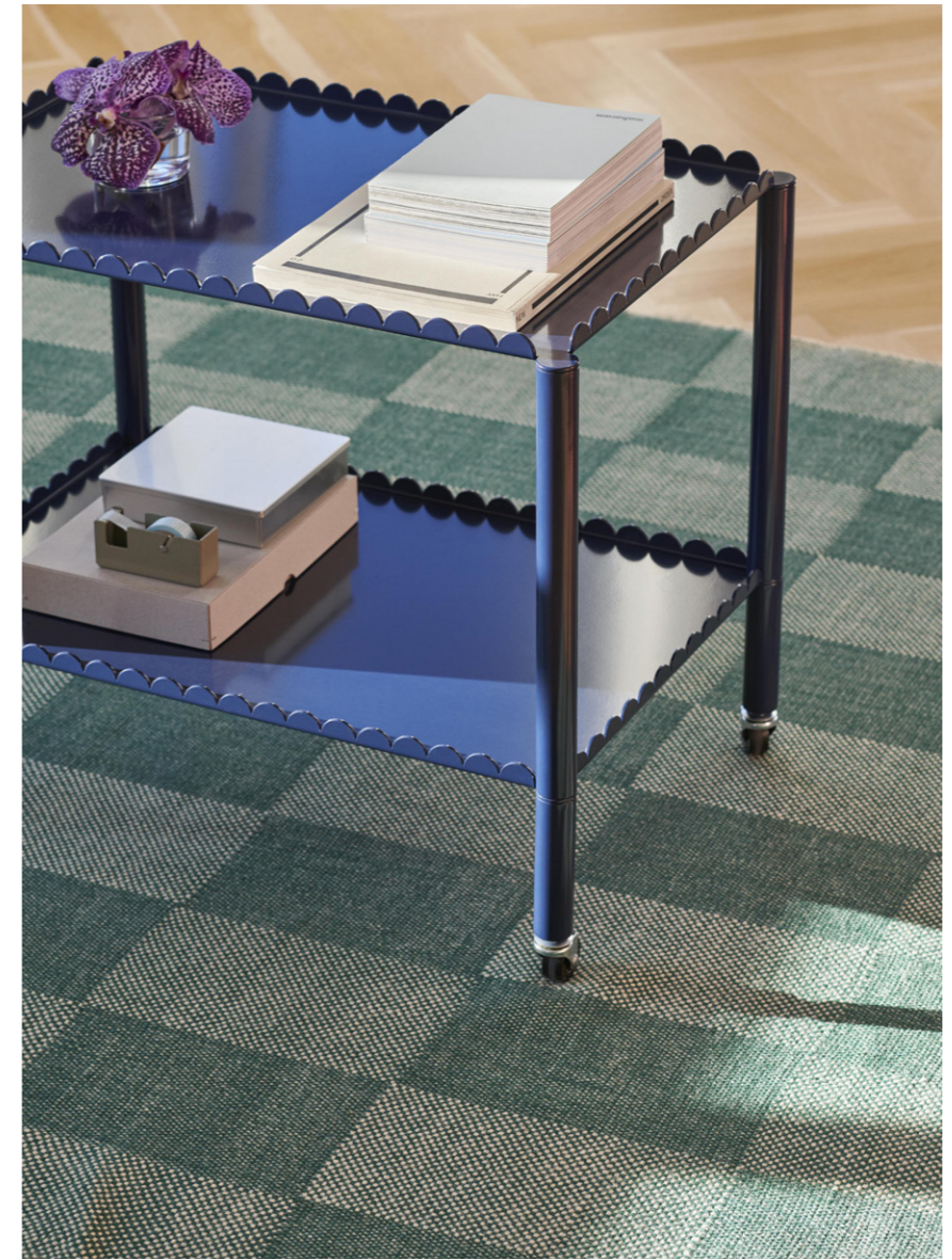
Arcs Trolley Low | Steel blue