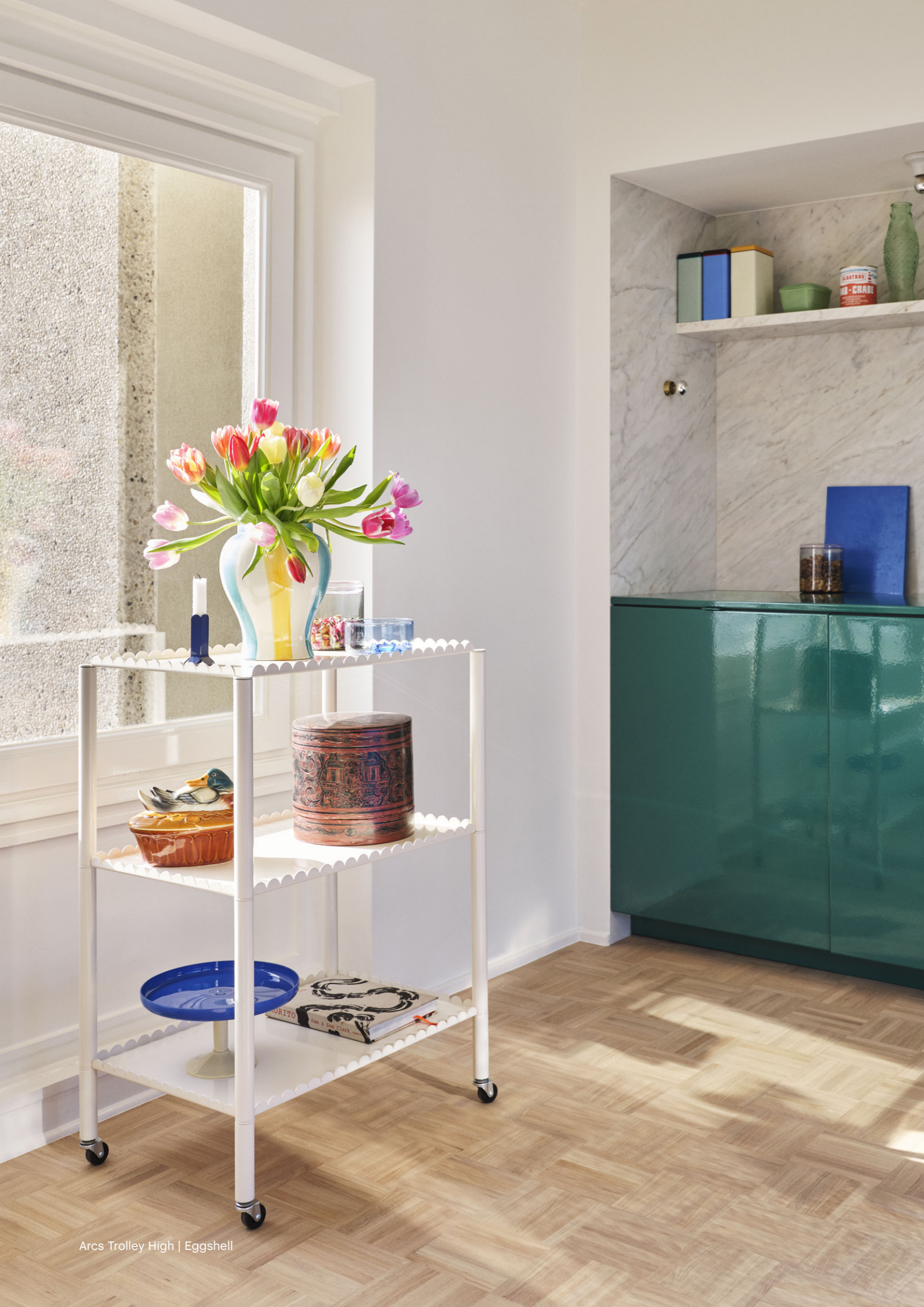
Arcs Trolley High | Eggshell