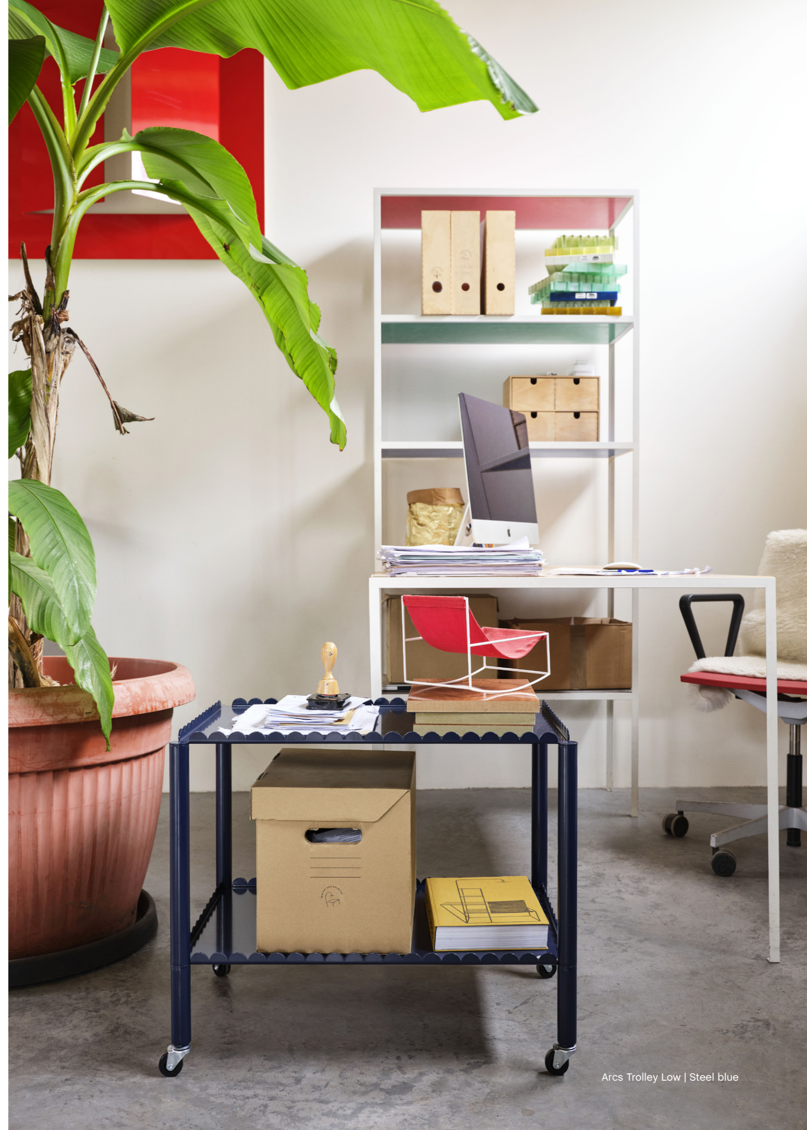
Arcs Trolley Low | Steel blue