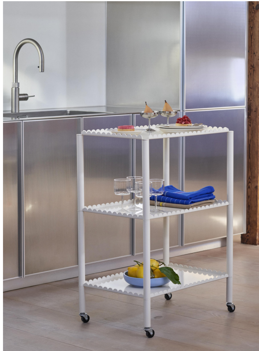
Arcs Trolley High | Eggshell