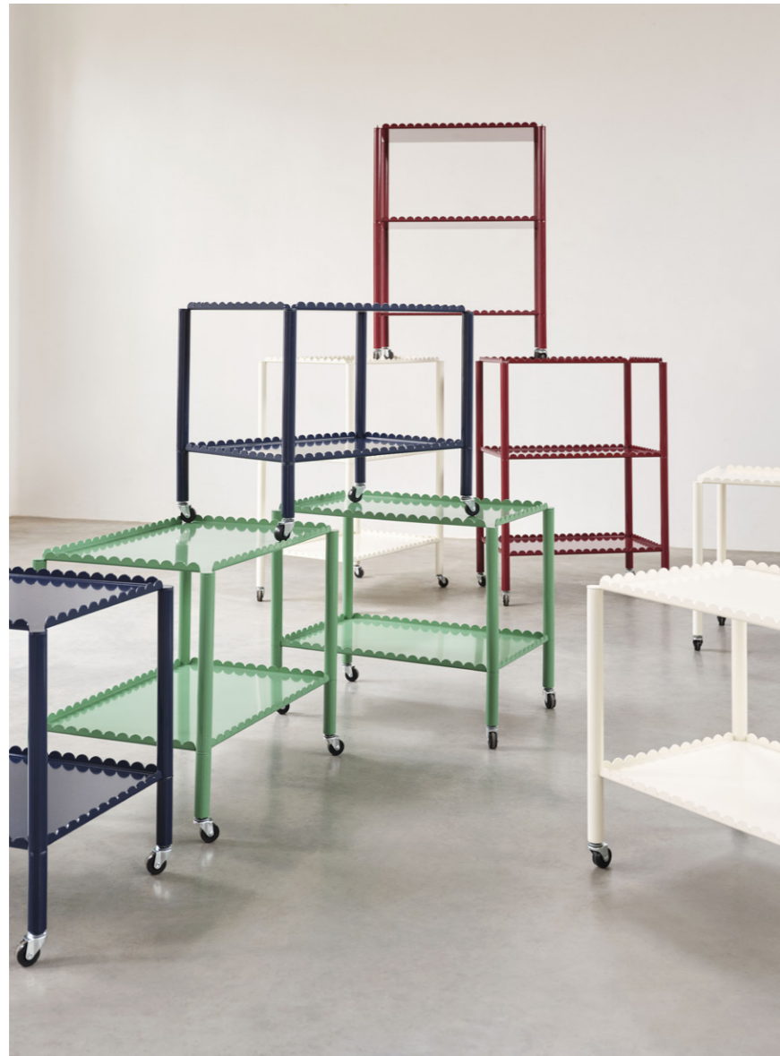
Arcs Trolley Family