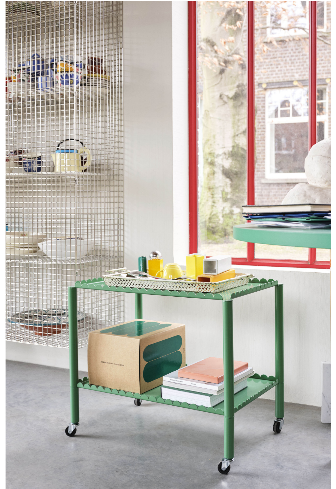
Arcs Trolley Low | Jade green