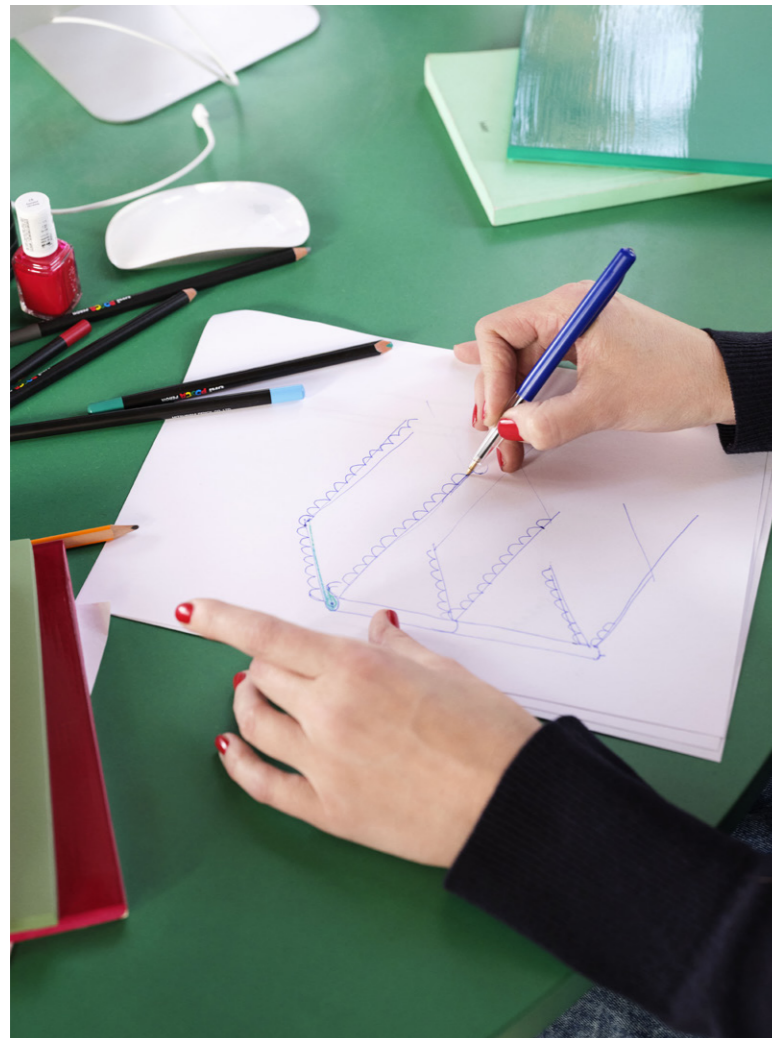
Fien Muller sketching Arcs Trolley

Driven by the concept that a good object needs to be both technical and poetic, Arcs Trolley balances equal measures of aesthetics and function to offer a broad functional use without losing character in design.