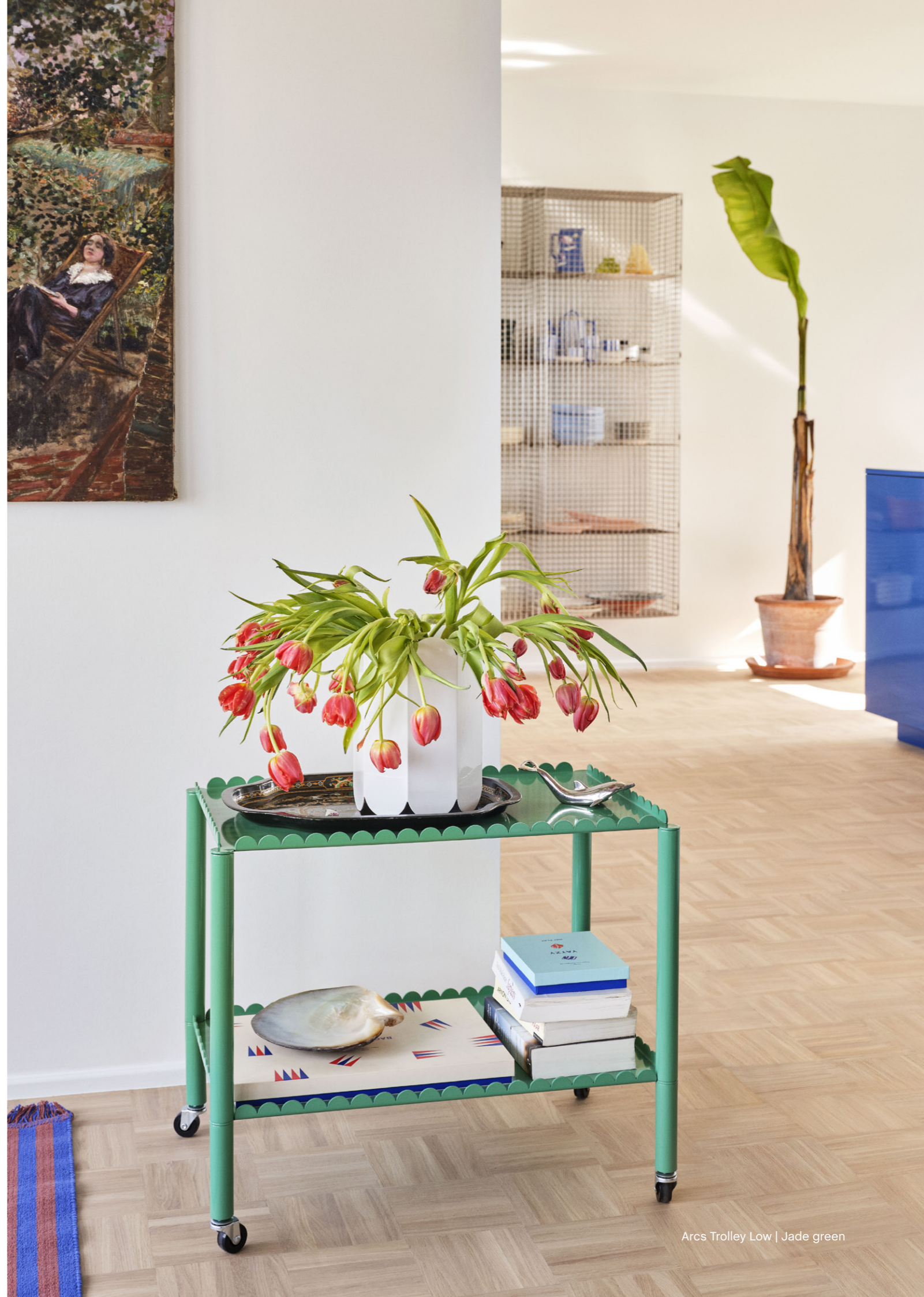
Arcs Trolley Low | Jade green