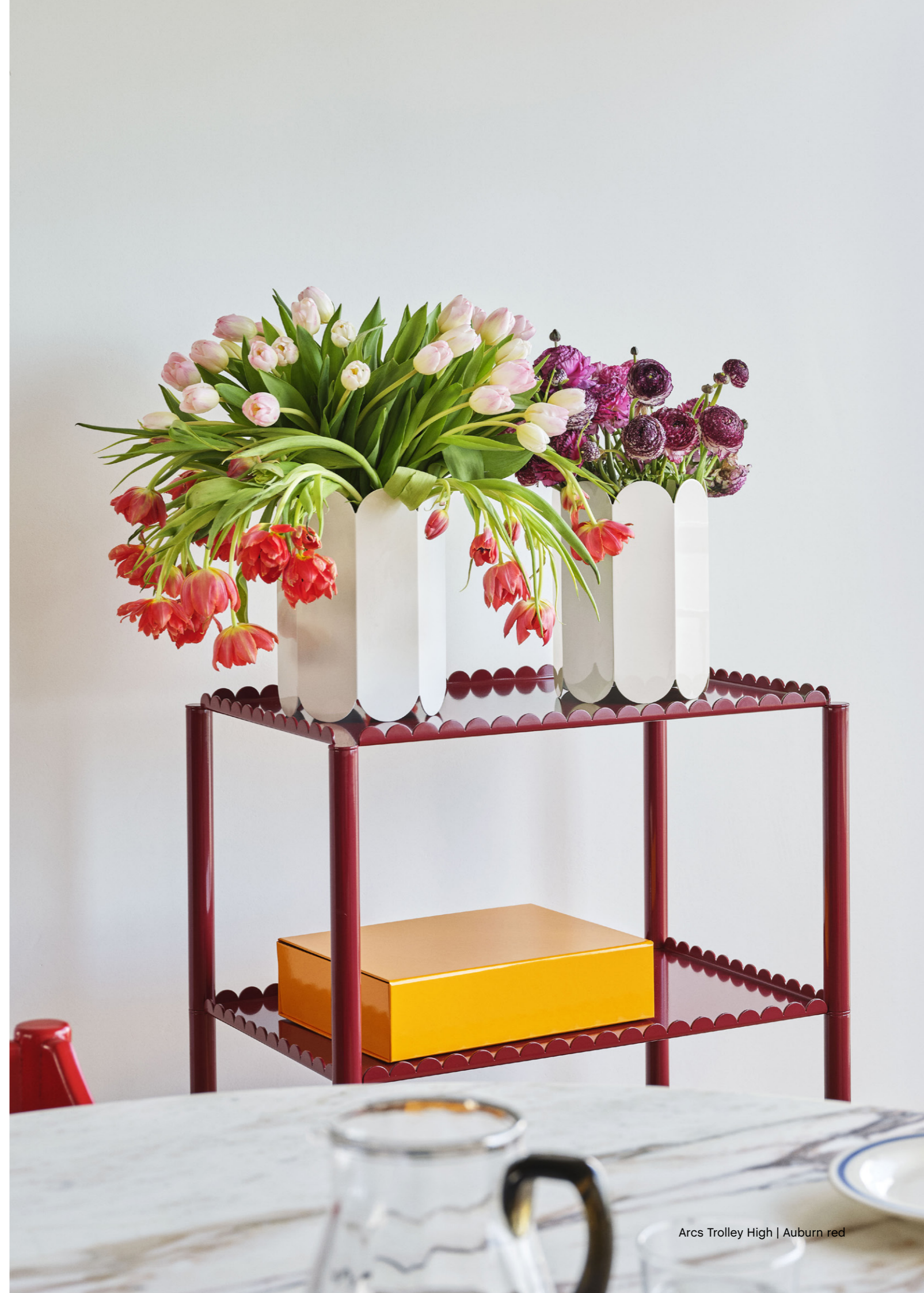
Arcs Trolley High | Auburn red