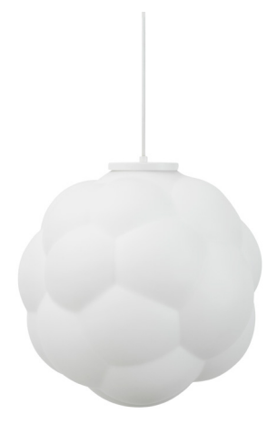
Bubba Lamp Ø42 H: 41 x Ø42 cm