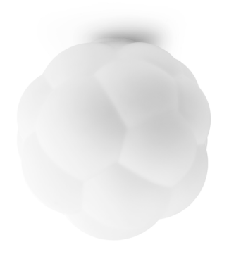
Bubba Lamp Ceiling Ø42 H: 45 x Ø 42 cm