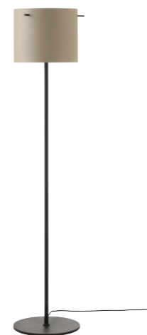
Item Number: 130273