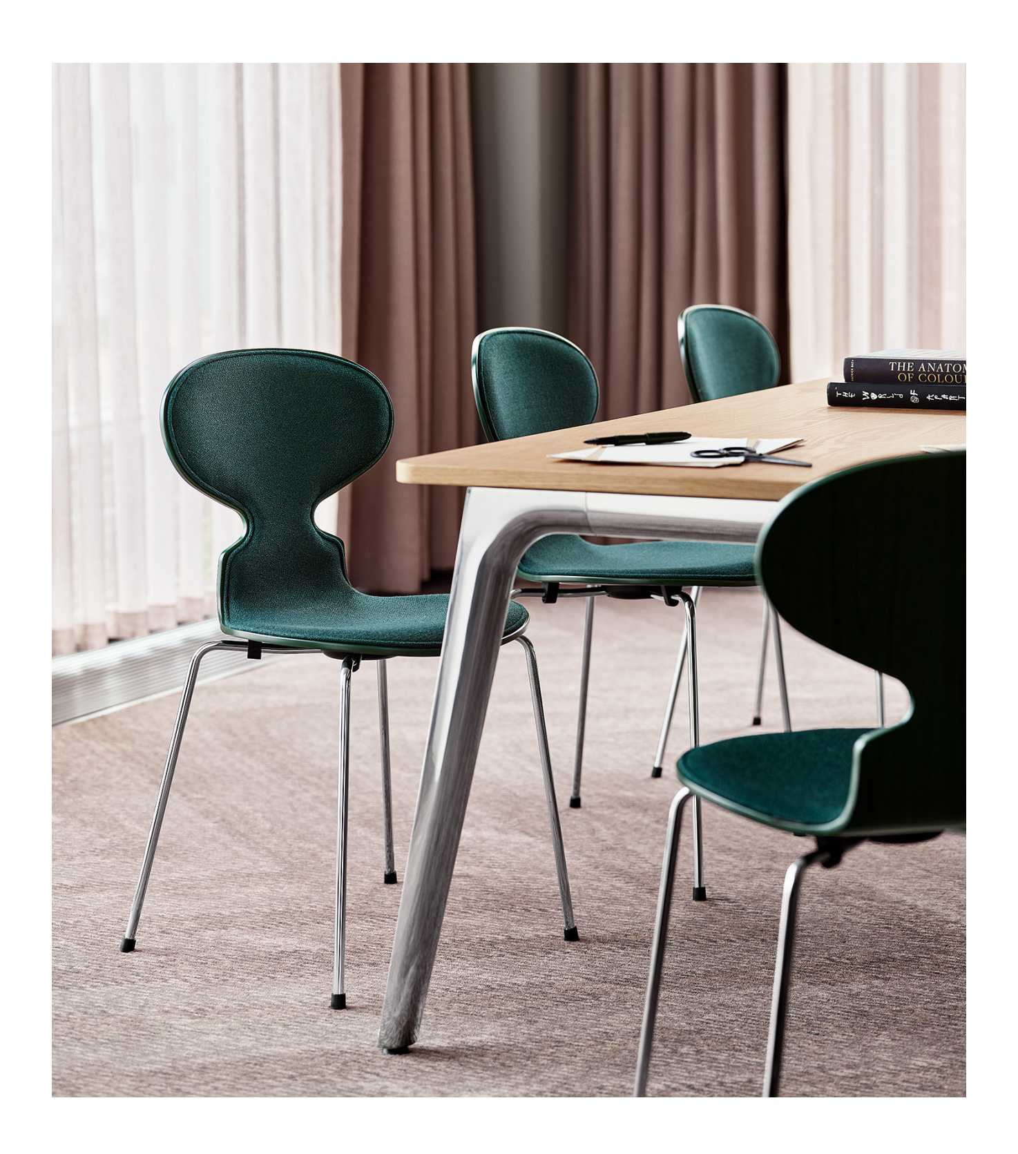
ANT™ PRODUCT FACT SHEET