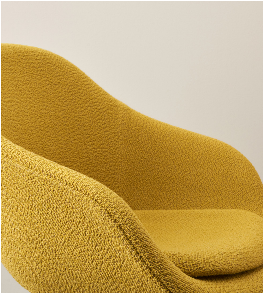
AAL 83 | Flamiber Mimosa E9 | Water-based lacquered oak base