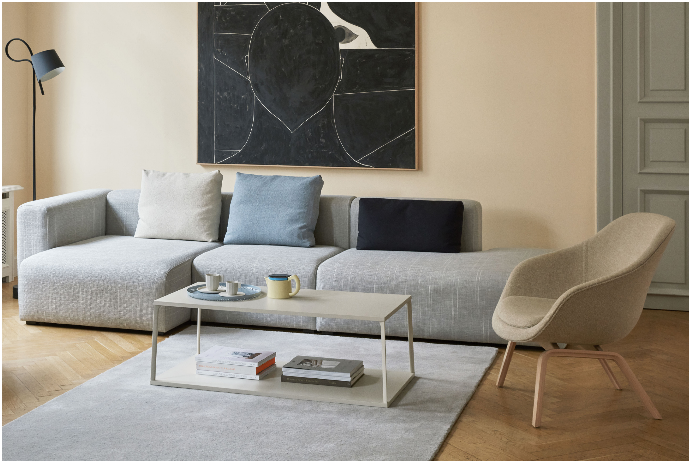
AAL 83 | Hallingdal 220 | Water-based lacquered oak base