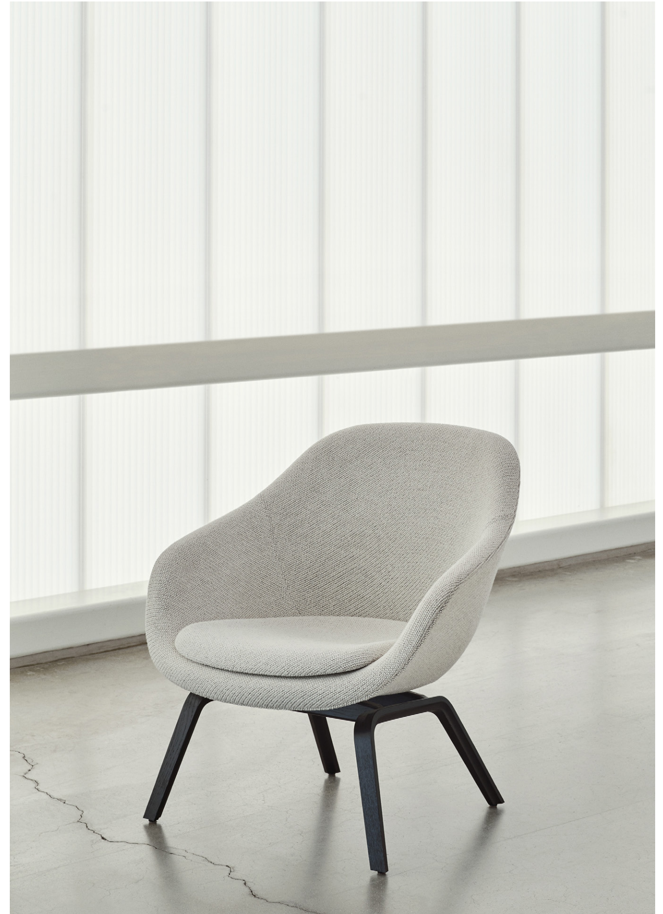
AAL 83 | Coda 100 | Black water-based lacquered oak base

With a moulded plywood frame this version of About A Lounge Chair is offset by the minimalist wooden frame, creating a slightly more angular expression. It is available in a low-backed version with a more intimate expression or in a high-backed version with an open, spacious feel. The wide choice of cushions, legs and upholsteries mean you can configure unique combinations that fit a variety of public and private contexts.