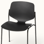
w/o upholstered seat