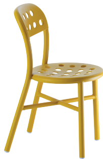
Mustard 5031 (only without arms)