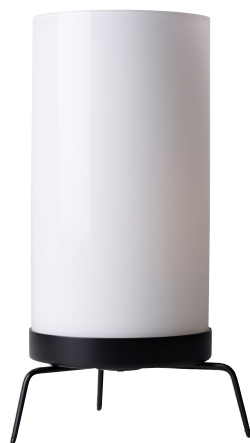
OPAL GLASS WITH BLACK LACQUERED STEEL BASE