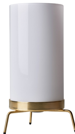
OPAL GLASS WITH UNTREATED SOLID BRASS BASE