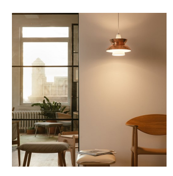
Carl Hansen & Son Showroom