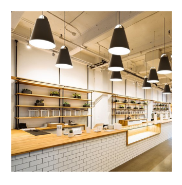
Set location: Alpha Dominche