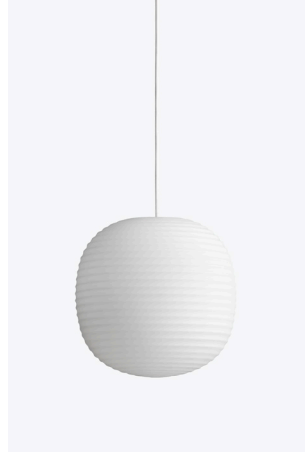
Lantern Pendant, Medium (Ø 300 mm)