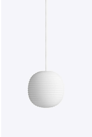
Lantern Pendant, Small (Ø 200 mm)