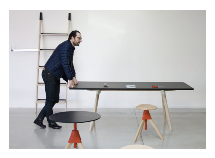
Designer in Magis

polypropylene joint and screw for height adjustment.