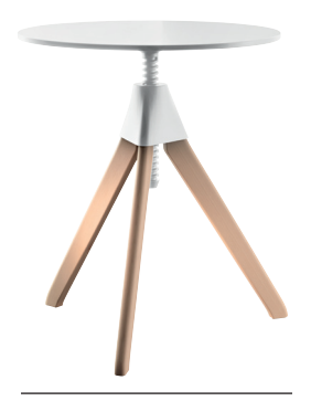
Frame: Natural Beech Joint + Screw: White 1735 C Top: White 8500