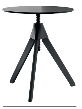
Frame: Beech stained Black Joint + Screw: Black 1754 Top: Black 8510