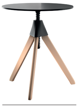
Frame: Natural Beech Joint + Screw: Black 1754 C Top: Black 8510