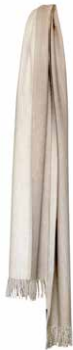
Beige/off white 4109

The His & Her scarf collection is woven in luxurious 100% baby alpaca wool with one colour on one side and a subtle contrast on the other. It is a must have for both women and men.