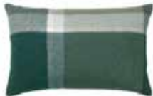
Evergreen/botanic green 9481