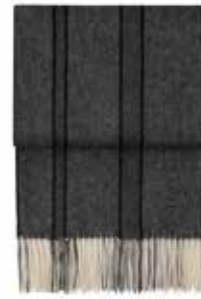
Dark grey/black 7600