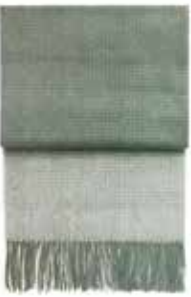
Botanic green 7501