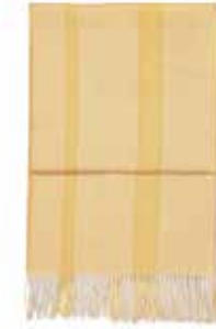
Yellow/yellow ocher 7606