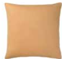
Yellow ocher 9620