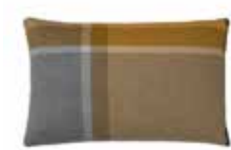
Yellow ocher/smoked glass 9421