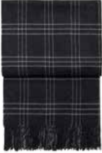
Dark grey/white 6102