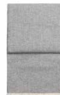
White/light grey/grey 7472