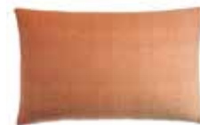
Pompeian red/terracotta 9523