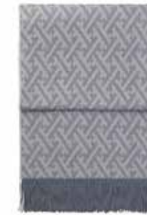
Grey blue/grey 6146