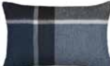
Dark blue/asphalt 9472