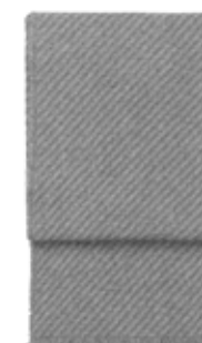
Grey/light grey 7452