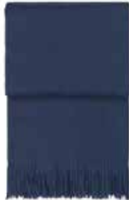
Dark blue 7082