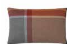
Terracotta/red magma 9411