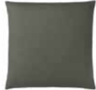
Botanic green 9631