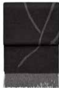
Light grey/dark grey 6122