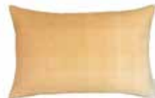
Yellow ocher 9533