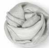
Light grey 4150

Feminine and with a light feel texture, this delicate scarf woven in a wonderful mix of baby alpaca wool and silk is absolutely magnificent. The scarf comes in three beautiful colours completed with fine eyelash fringes.