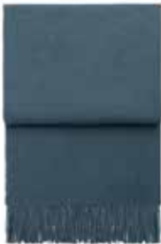
Midnight blue 7030