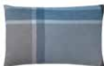
Steel blue/dusty ocean 9441