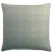
Botanic green 9504