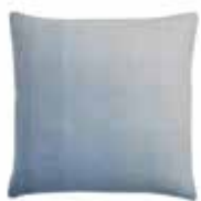
Midnight blue 9506