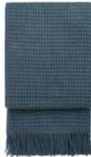
Orion blue 7402