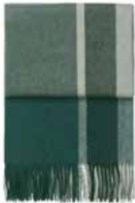
Evergreen/botanic green 7062

The Manhattan collection is inspired by New York’s borough of Manhattan, whose straight streets and right angles create square blocks. Lines crisscross and create contrast and vibrancy. The design creates a balance between the classic, timeless and forward-thinking modernism.