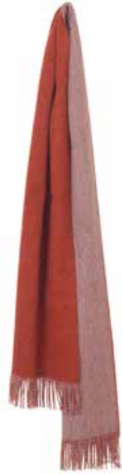
Rusty red/light grey 4121