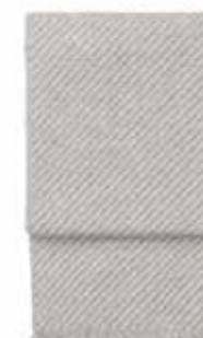
White/light grey 7450