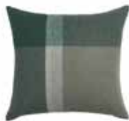
Evergreen/botanic green 9483