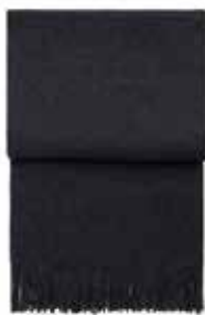
Dark grey 6007

100% baby alpaca wool 130 x 180 cm / 51 x 71 inches. Weight app. 700 g