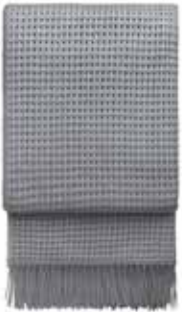
Light grey 7401