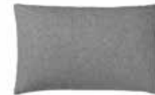
Light grey 9104