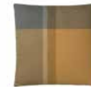
Yellow ocher/smoked glass 9423