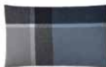
Steel blue/dusty ocean 9442