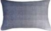
Dark blue 9531