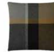
Yellow ocher/smoked glass 9424