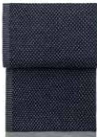
Royal blue 6202