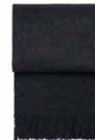
Dark grey 7006