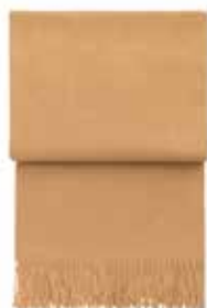
Yellow ocher 7020