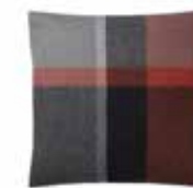
Terracotta/red magma 9414