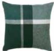
Evergreen/botanic green 9484