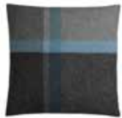
Steel blue/dusty ocean 9444