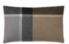
Yellow ocher/smoked glass 9422