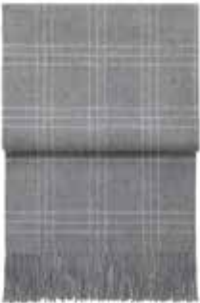
Light grey/white 6101

The Superior collection is made of the finest baby alpaca wool. In this collection natural pureness and design come together. The softness is extraordinary.