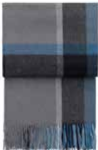
Steel blue/dusty ocean 7068