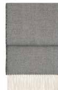
Black/flint grey/white 6180