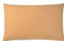
Yellow ocher 9120