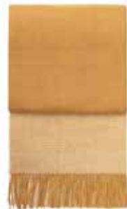
Yellow ocher 7510