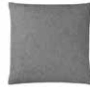
Light grey 9604