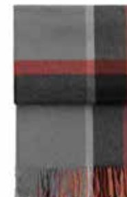
Terracotta/red magma 7065