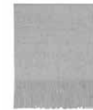
Light grey 4141