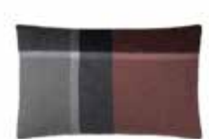
Terracotta/red magma 9412