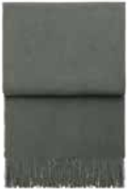
Botanic green 7031