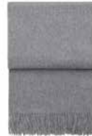
Light grey 7004