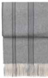
Light grey/grey 7601