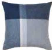
Dark blue/asphalt 9473