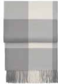
Flint grey/cream 6160