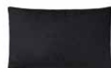
Dark grey 9106