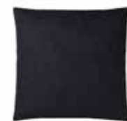
Dark grey 9606