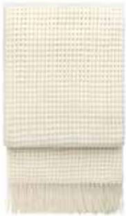
Off white 7400

The Basket collection is inspired by a beautifully woven basket characterized by its vivid structure. An elegant and timeless design.