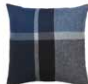
Dark blue/asphalt 9474