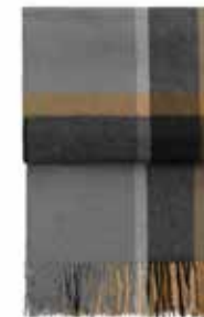
Yellow ocher/smoked glass 7066