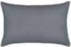
Grey blue 9185