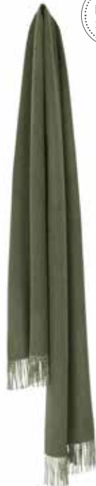
Army/dusty green 4123