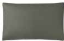
Botanic green 9131