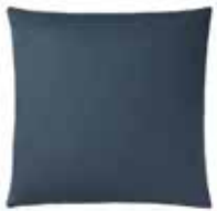
Midnight blue 9630