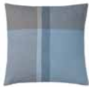
Steel blue/dusty ocean 9443