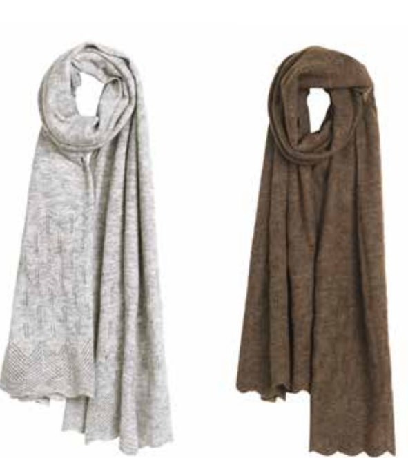
Light grey 4270

Paris is a feminine scarf with a subtle and decorative hole knitted pattern. Ideal for everyday use.