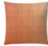
Pompeian red/terracotta 9524