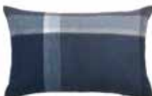
Dark blue/asphalt 9471