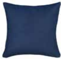
Dark blue 9682