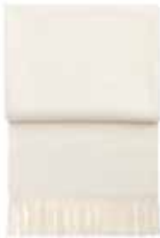
Off white 6004

The Luxury collection of essential colours is made of 100% baby alpaca wool. The name is inspired by the feeling of luxury that you experience, when the amazingly soft baby alpaca wool caresses your skin.