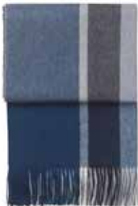
Dark blue/asphalt 7061