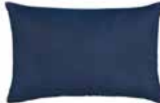
Dark blue 9182