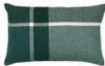
Evergreen/botanic green 9482