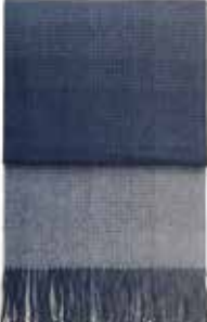
Dark blue 7509