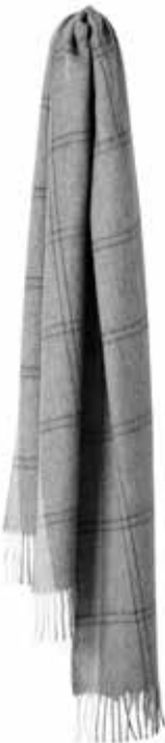
Light grey 4241