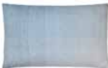
Midnight blue 9505