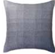
Dark blue 9532