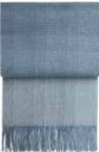
Midnight blue 7502