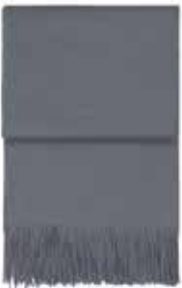
Grey blue 7085