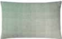
Botanic green 9503