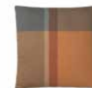
Terracotta/red magma 9413