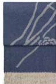
Blue grey/beige 6123