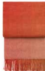
Pompeian red/terracotta 7505