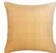
Yellow ocher 9534