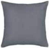
Grey blue 9685