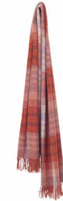
Rusty red 4266