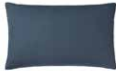
Midnight blue 9130