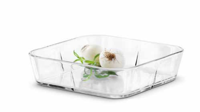
Oven-proof dish medium