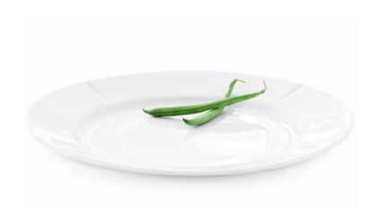
20301 Plate 30 cm

The design of Grand Cru series porcelain won't steal all the attention from the food, but creates a simple setting in which to present it. And the many components of the series make it possible to create the most beautiful and inviting tables.