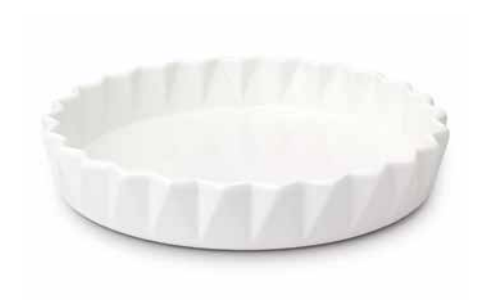
20345 Quiche dish 28 cm

The oven-safe dishes are designed to ease the process from food preparation to serving and to storing leftovers. The glass dishes are designed to be taken directly from oven to table. The series also features holders to protect your fingers from burns, and the lids make it possible to move leftovers directly from the table to your fridge.