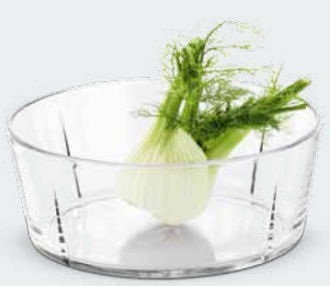
25606 Oven-proof bowl 24 cm