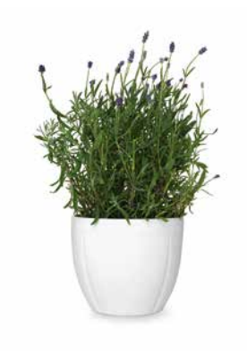
Flowerpot, white 14 cm and 16 cm