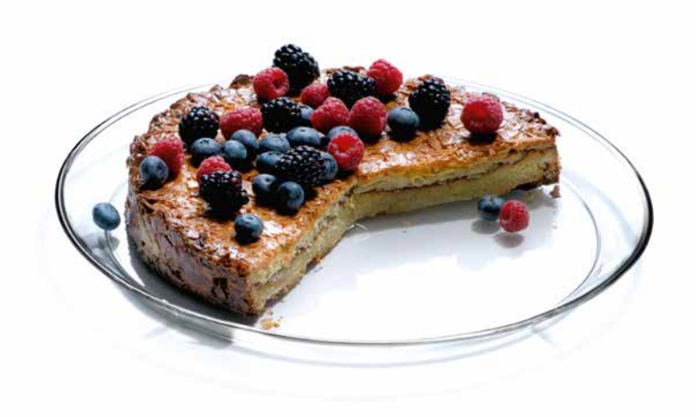
Serving dish 32 cm