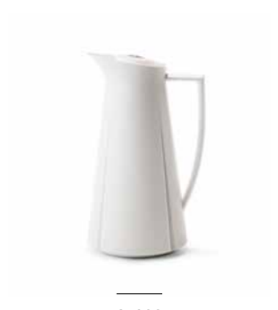
Thermos white 1.0 I