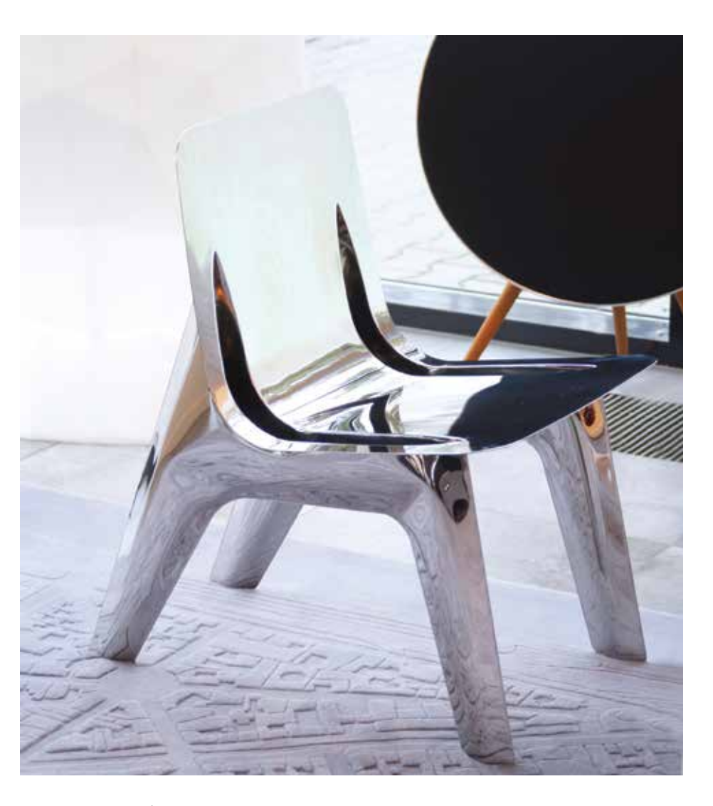
J-chair is another FiDU manifesto. It bonds a strong and iconic visual character with a light and durable costruction.