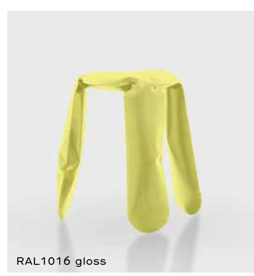
Out of ordinary