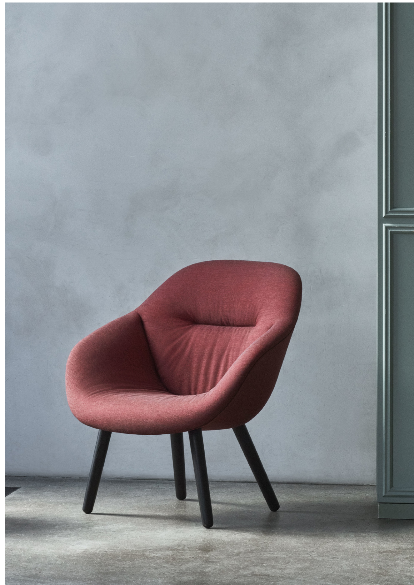
AAL 82 Soft | Remix 662 | Black water-based laquered oak base

The AAL 82 Soft fuses the natural elegance and character of the four-legged wooden base with the softness and warmth of the quilted shell. Retaining the same compact body, shaped armrests, and simple, sculpted design that characterise the rest of the lounge series, this design rests upon four solid, rounded legs. The oak base is available in different finishes and the quilted shell is offered in a variety of upholstery options, providing a multitude of design combinations that give this series versatility in a wide range of corporate, public, and private contexts.