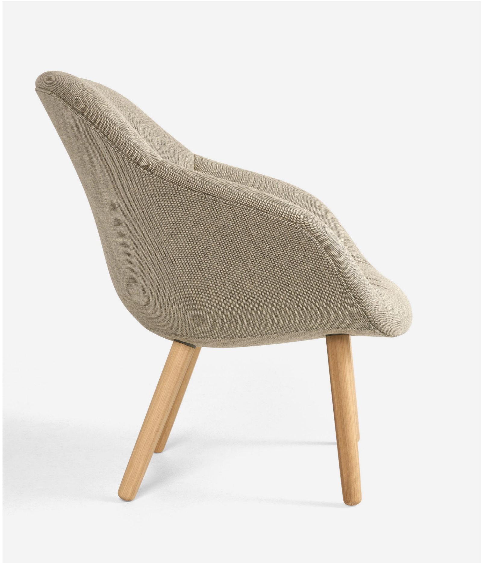
AAL 82 Soft | Re-wool 218 | Water-based laquered oak base